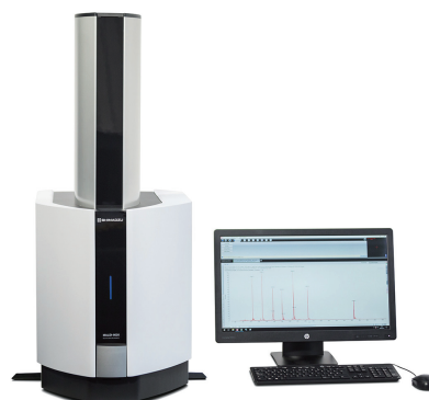
Fig. 1 MALDI-8020 Benchtop MALDI-TOF MS

Pretreatment of the samples was carried out in accordance with the method provided in the ISO standard. (2) The outline of the pretreatment procedure is as follows. Raw hair of cashmere and sheep wool was cut with scissors and crushed to a fine powder with a ball mill. Next, 4% sodium dodecyl sulfate (SDS) containing 50 mM of dithiothreitol (DTT), and 0.5 ml of 0.1 M of a phosphate buffer solution (pH 7.8) were added to 10 to 50 mg of the crushed raw hair, and the solution was then heated at 95 °C for 15 min to 1 h. After heating, iodoacetamide was added to the extract solution to adjust the concentration to 100 mM. The solution was then reacted at room temperature for 15 min, after which the reaction was stopped by adding 10 μL of 25 mM DTT. The extract was separated and stained by SDS polyacrylamide gel electrophoresis (SDS-PAGE), and gel pieces containing the target protein were cut out. After removing the stain Coomassie Brilliant Blue (CBB) by using 50 mM ammonium bicarbonate/50% acetonitrile, the sample was digested at 50 °C for 1 h by adding approximately 150 ng of trypsin.